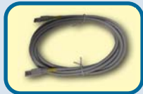
Ethernet (CAT5 UTP/Straight Through) Cable