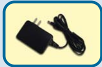
48V DC Power Adapter