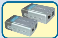
DWL-P200 Base Unit and Terminal Unit