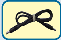
Female-to-Female Power Connector