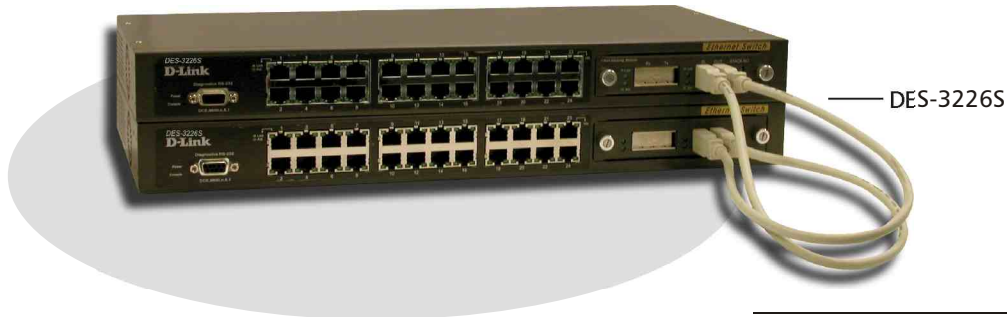
DES-3226S with 24 10/100Mbps ports. A DES-332GS stack module installed in the open slot provides a GBIC port and switch stacking capability.